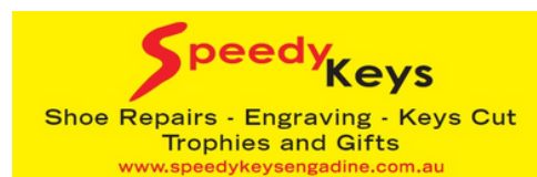
SPEEDY KEYS ENGADINE